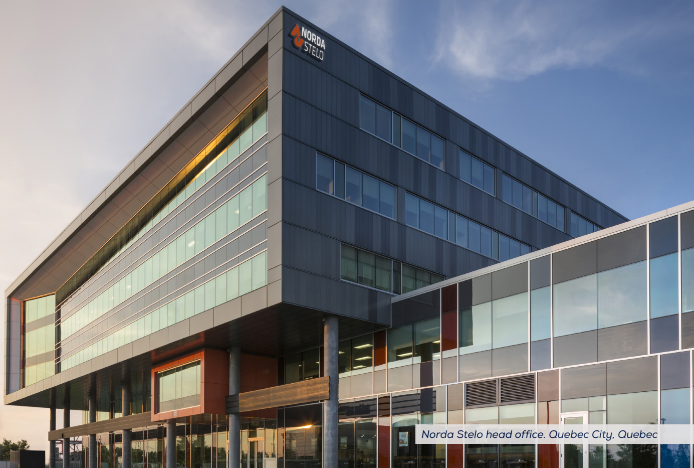
Norda Stelo head office. Quebec City, Quebec