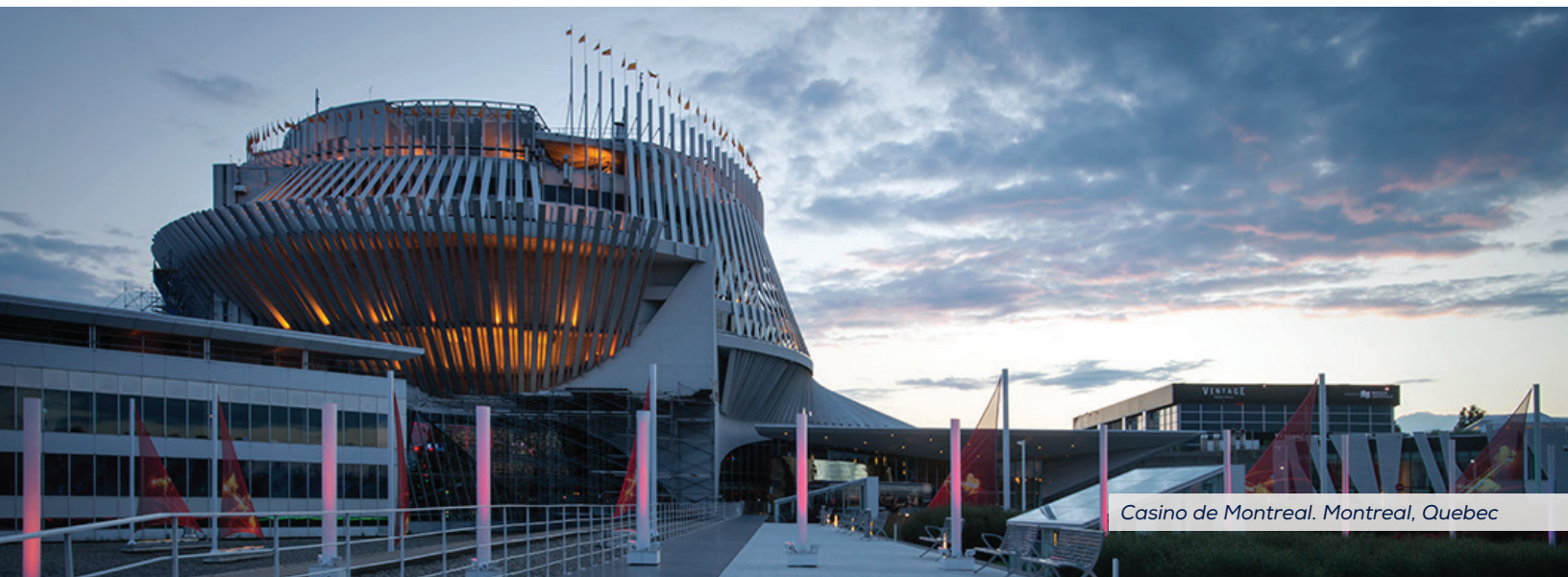
Casino de Montreal. Montreal, Quebec